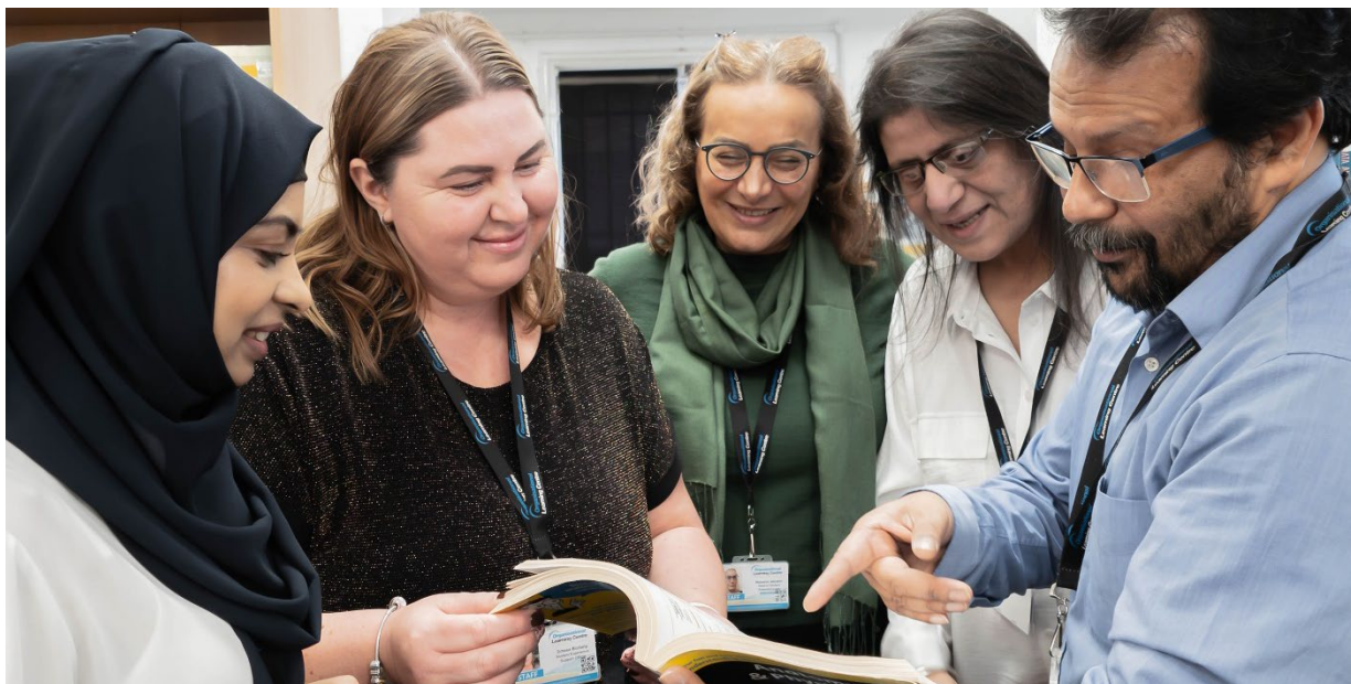
Members of the Student Experience and Enhancement Team